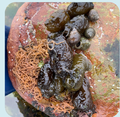
Sea Hare ( Aplysia punctata )

Everybody was very respectful of our marine life and it was great to show people the locals that live in our rockpools. We noticed lots of Sargassum seaweed in the pools, which led to lots of the pools being suffocated. We also noticed an increase in sea hares, with one rock having eight individuals living on it! There's always new and interesting species to see.