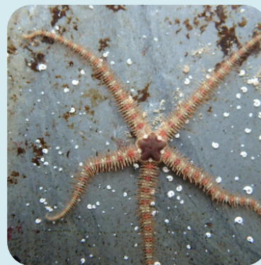
Common Brittle Star ( Ophiothrix fragilis )