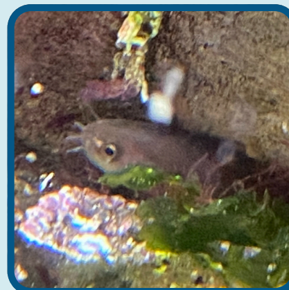
Shore Rockling ( Gaidropsarus mediterraneus )