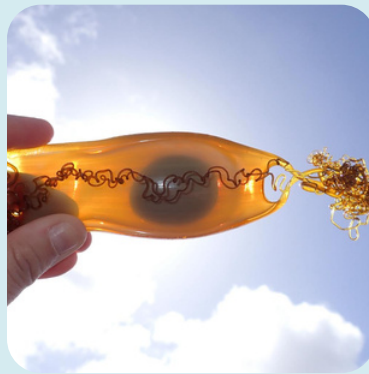
Spotted Dogfish Egg Case ( Scyliorhinus stellaris )