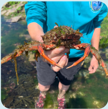
Spiny Spider Crab ( Maja squinado )