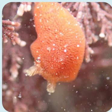
Red Velvet Sea Slug ( Rostanga rubra )