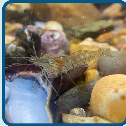
Common Prawn ( Palaemon serratus )