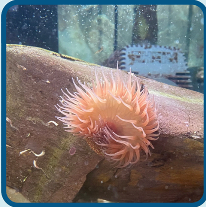
Strawberry Anemone ( Actinia fragacea )