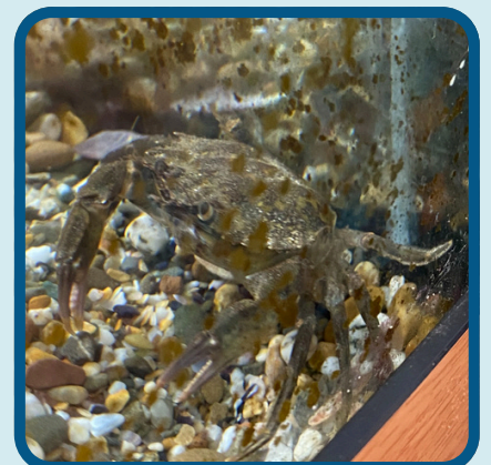
Shorecrab ( Carcinus maenas )