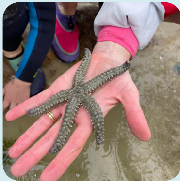
Spiny Starfish ( Marthasterias glacialis )