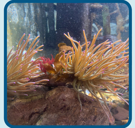
Snakelocks Anemone ( Anemonia viridis )