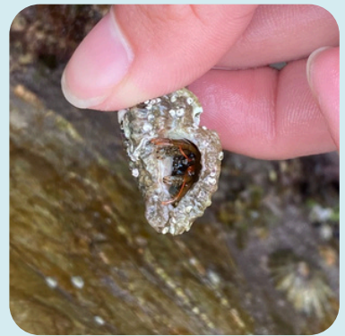
St Pirans Hermit Crab ( Clibanarius erythropus )