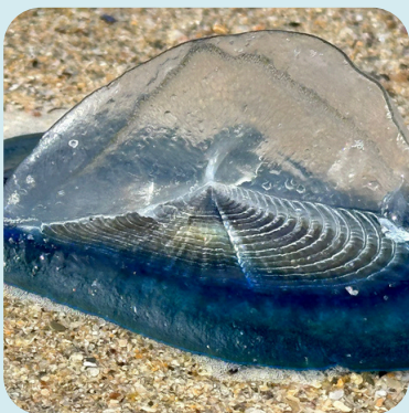
By The Wind Sailor ( Velella velella )