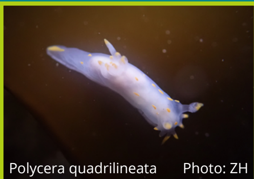
Polycera quadrilineata