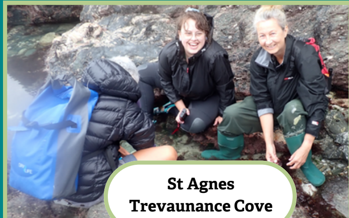
St Agnes Trevaunance Cove