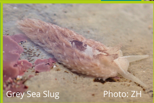
Grey Sea Slug