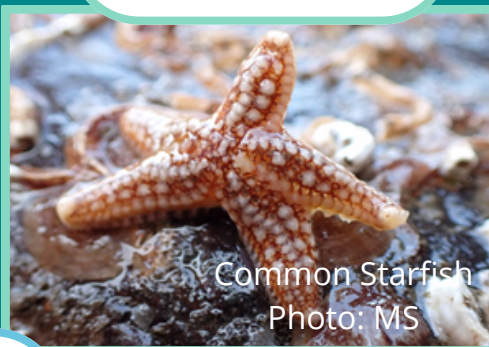
Common Starfish