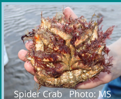
Spider Crab