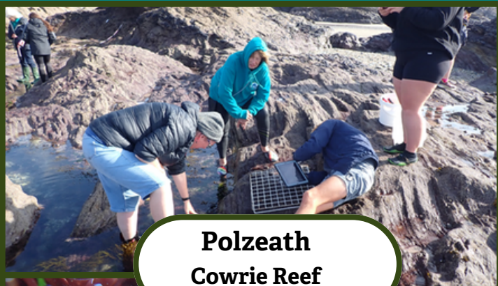
Polzeath Cowrie Reef

Every year, the shoresearch team and its amazing volunteers survey the 5 original Cornish VMCA's. Here's what we got up to and what we found in 2023!