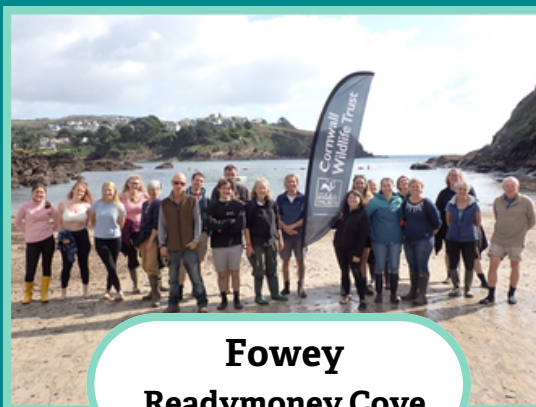
Fowey Readymoney Cove