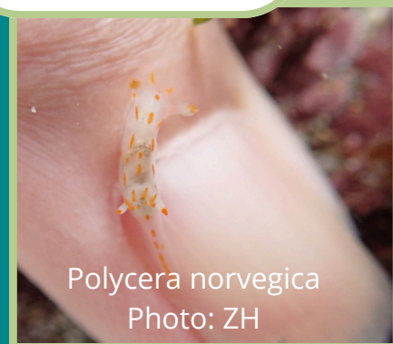
Polycera norvegica