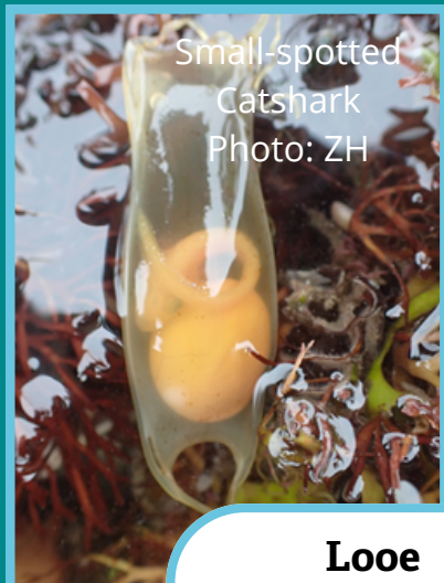
Small-spotted Catshark