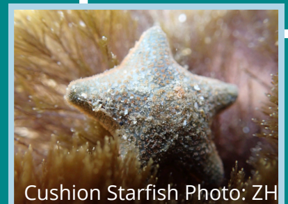
Cushion Starfish