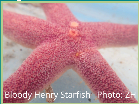
Bloody Henry Starfish

Many rockpool rambles were held by marine groups across Cornwall during National Marine week! This included one at Prisk cove, Perranporth, St Agnes, and Newquay.