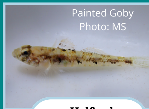
Painted Goby