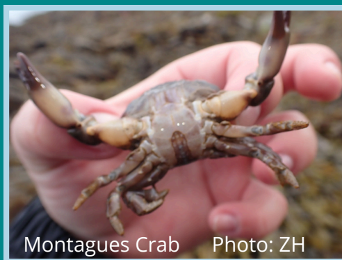
Montagues Crab