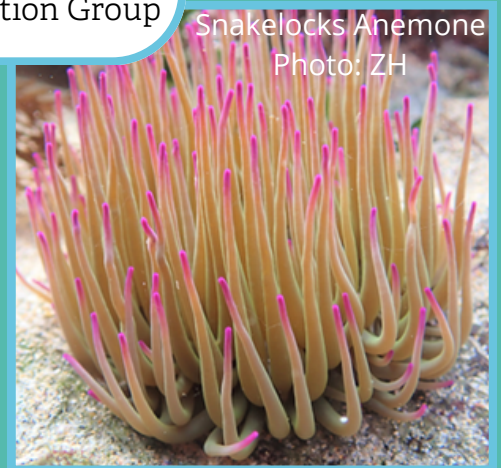
Snakelocks Anemone