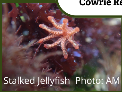
Stalked Jellyfish