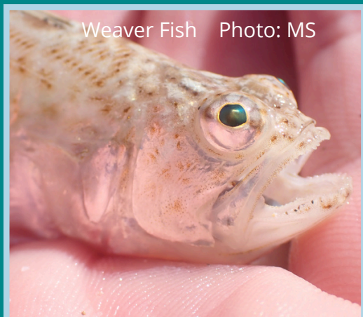
Weaver Fish