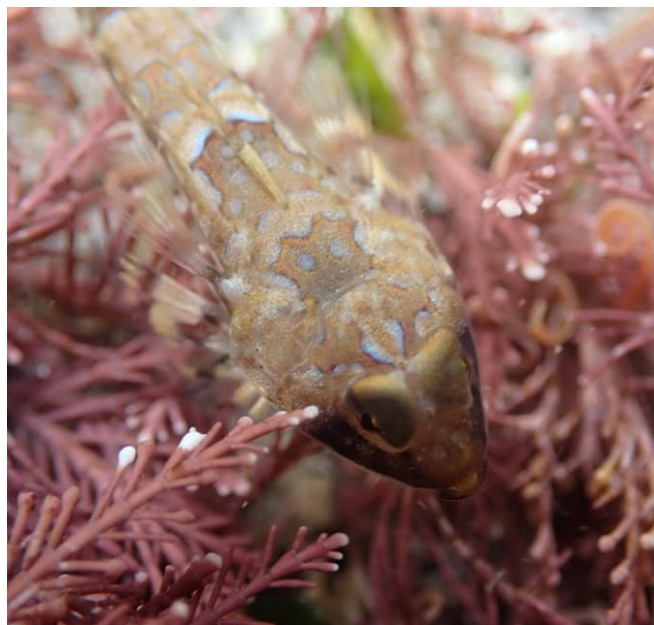
A young reticulated dragonette