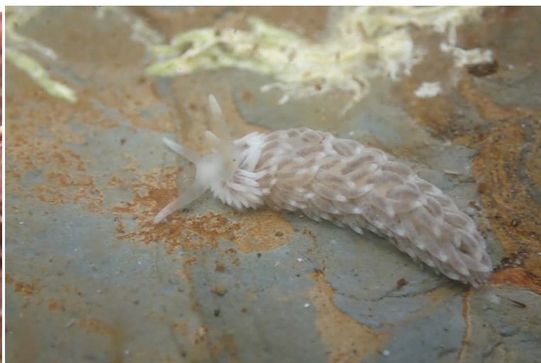
White-ruffed sea slug