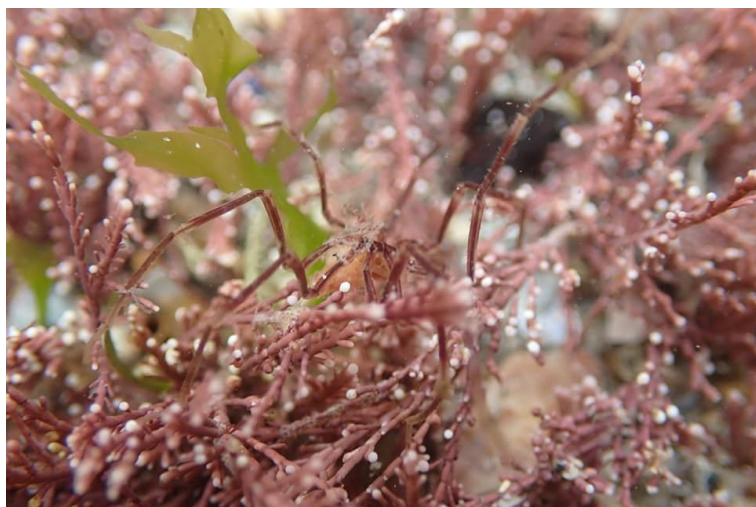
Sea spider carrying eggs