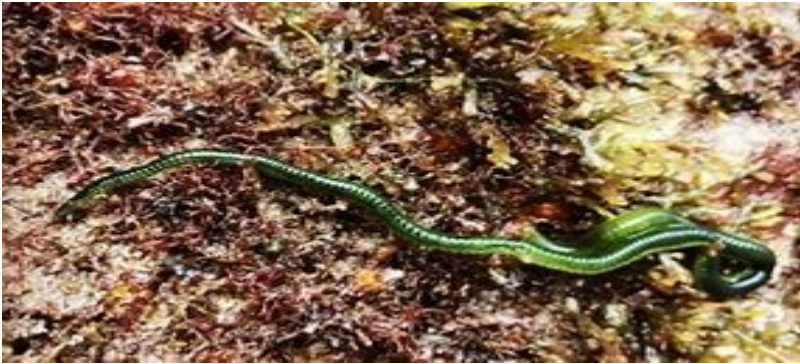
Green leaf worm

As the sessions were as popular as ever we managed to fit in 20 sessions over the 6 weeks and the consensus of opinion was that the volunteers preferred this way rather than taking groups of up to 50 people. We will see what happens with the corona virus next year but think that the days of taking 50 people are over, but 3 rambles a week is too much to expect the volunteers to help with so we will find some middle ground.