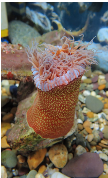
Strawberry showing stinging polyps