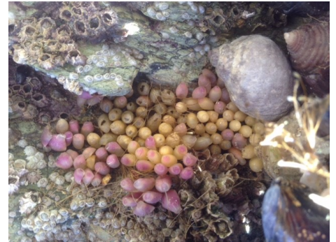
Dog whelk eggs