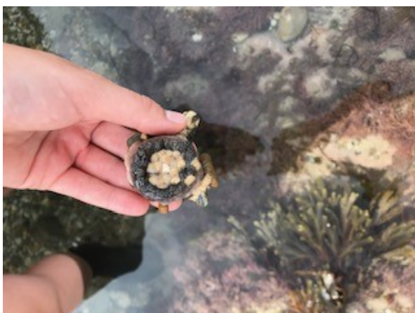
Daisy Anemone reproducing