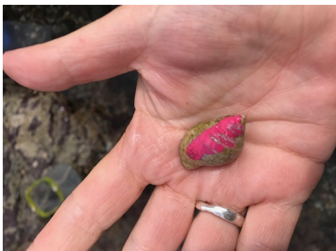
Marked shell for hermit crab